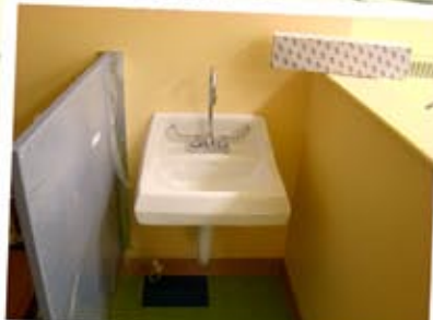
New Toddler Bathrooms