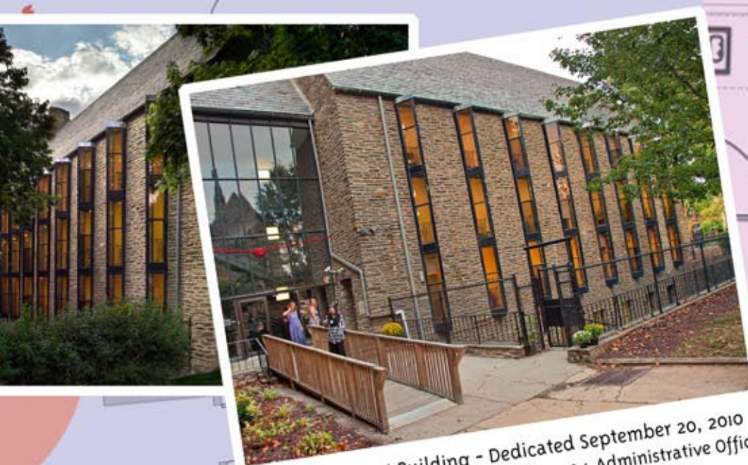
Mami Sweet Building - Dedicated September 20, 2010 6 New Classrooms • Gross Motor Room • 4 Administrative Offices