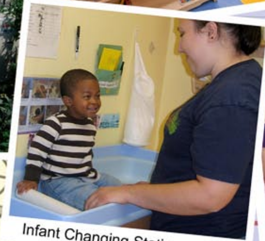
Infant Changing Stations